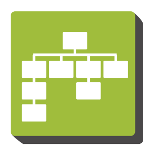
STRATEGY & PLANNING